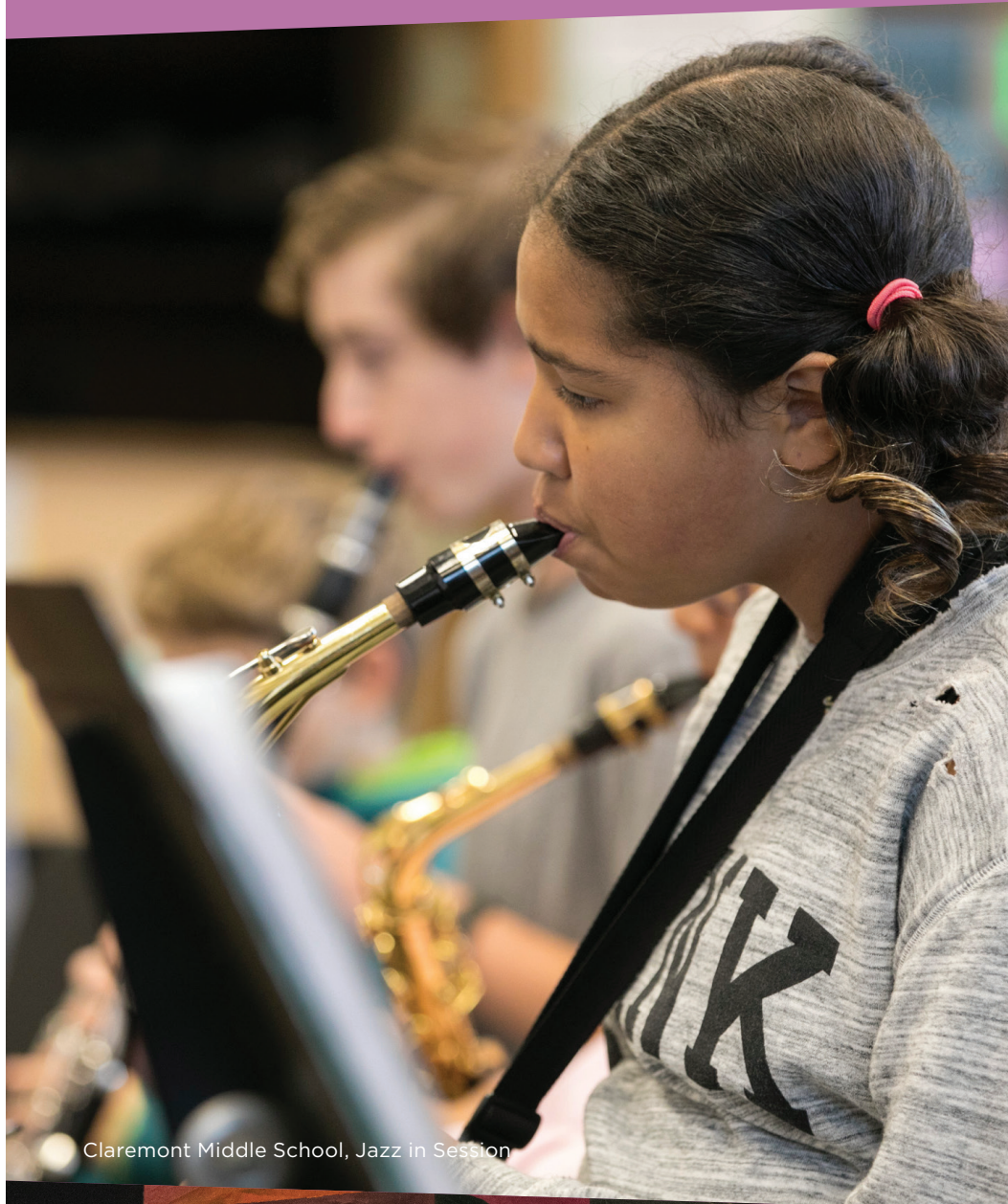
Claremont Middle School, Jazz in Session