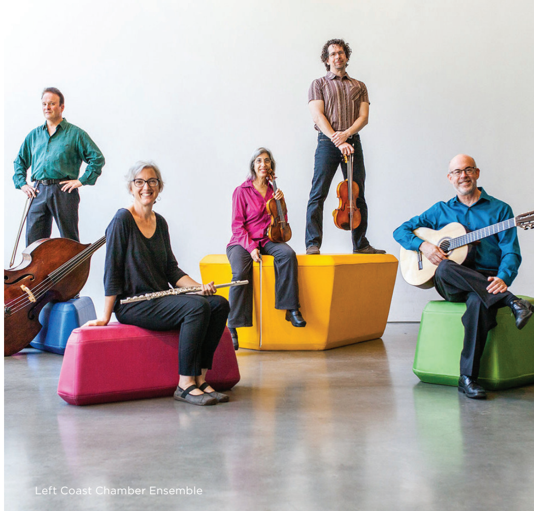
Left Coast Chamber Ensemble

“THE COOLEST KIDDIE SHOW.” —RED TRICYCLE