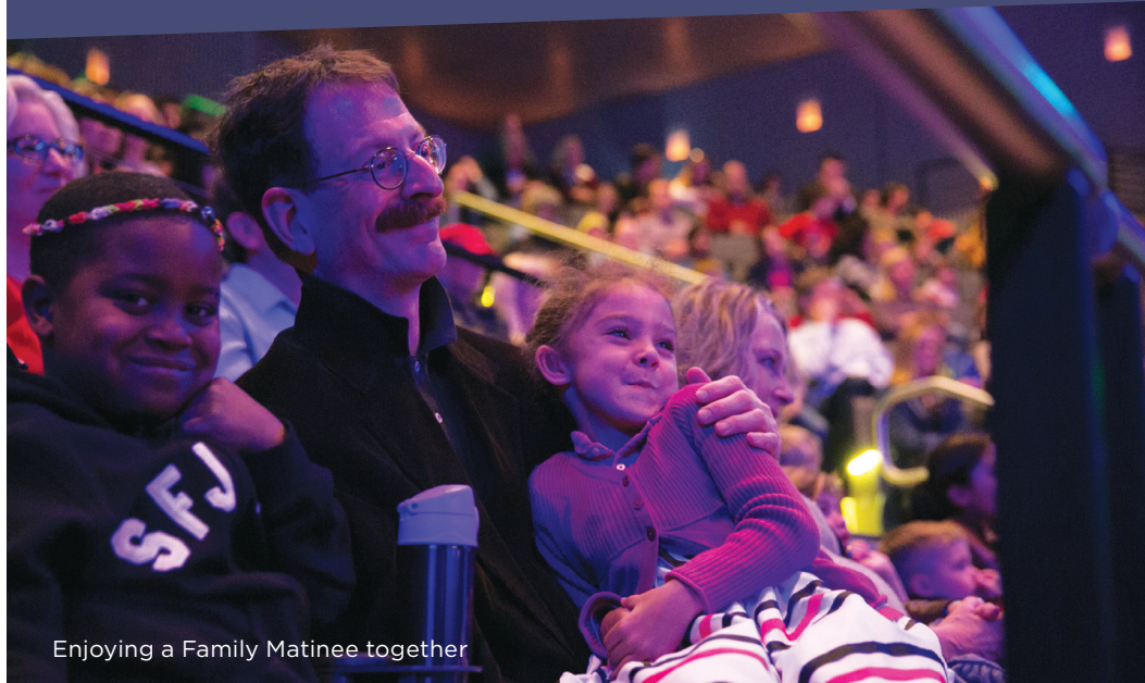
Enjoying a Family Matinee together