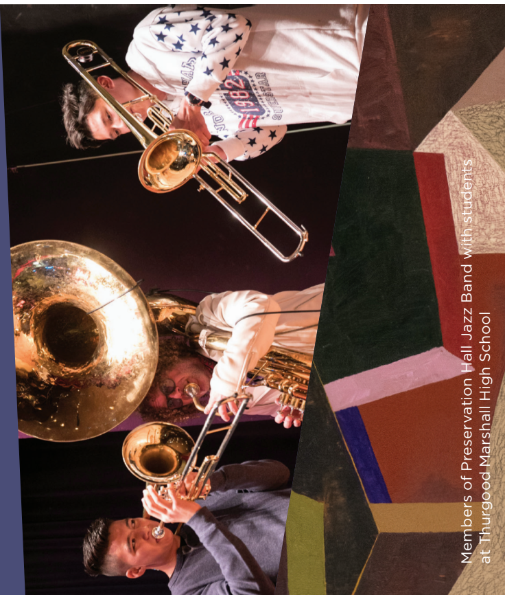
Members of Preservation Hall Jazz Band with students at Thurgood Marshall High School