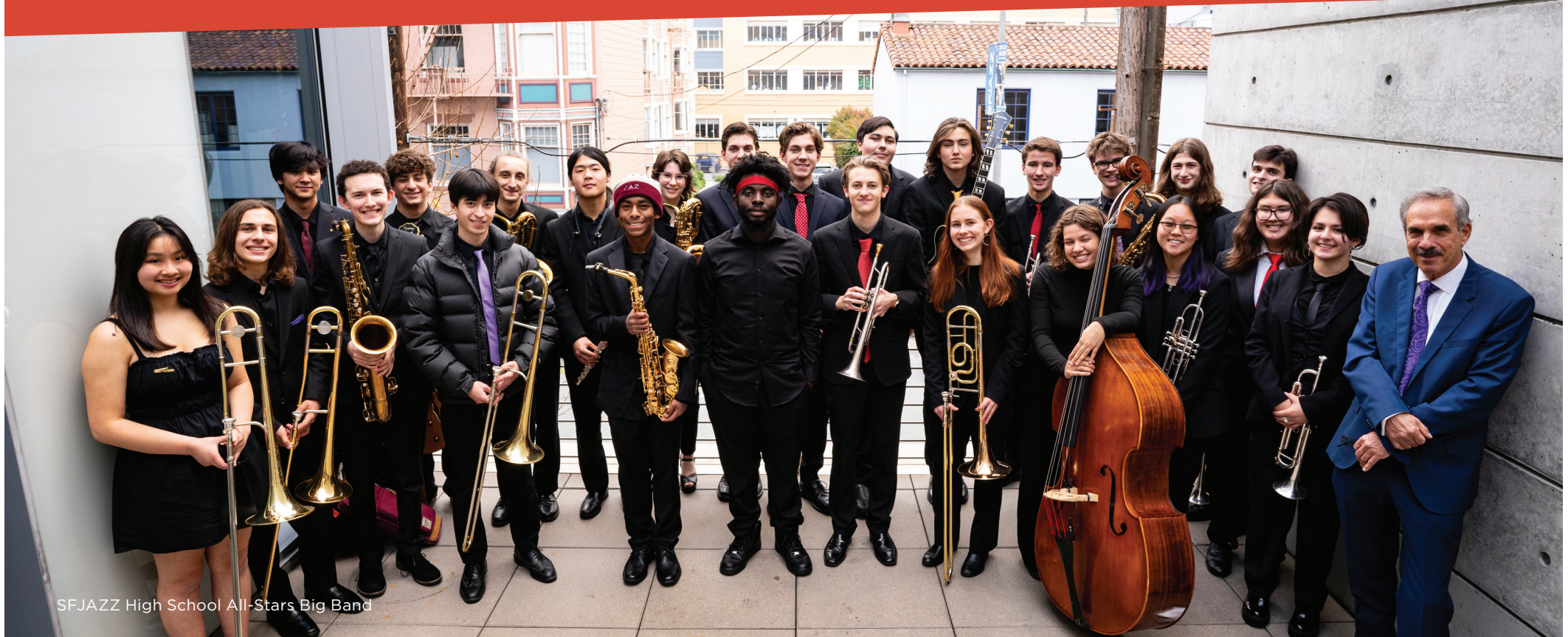
SFJAZZ High School All-Stars Big Band

"THE ALL-STARS ARE SOME OF THE MOST TALENTED AND COMMITTED YOUNG PLAYERS I'VE EVER HAD A CHANCE TO WORK WITH." —SAXOPHONIST MIGUEL ZENÓN