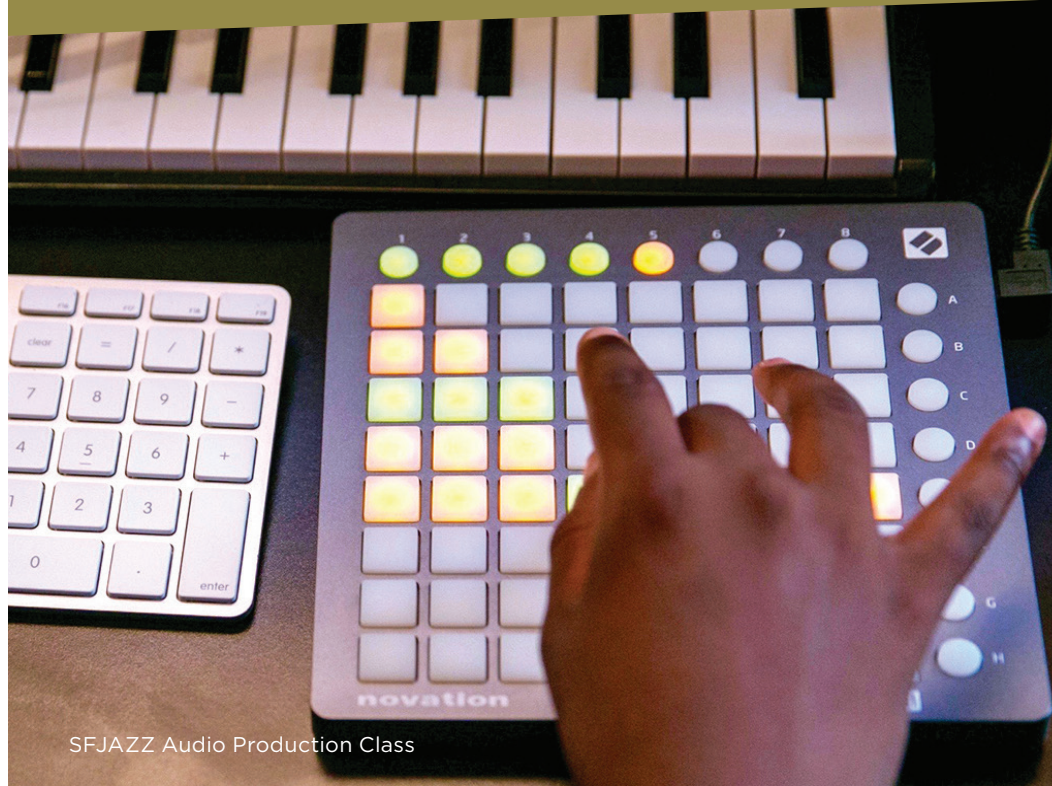
SFJAZZ Audio Production Class

T he SFJAZZ Digital Lab program continues in our online virtual format! Insightful and informative workshops exploring how digital music is created and performed today, with an emphasis on live performance and improvisation, DJing, recording, mixing and mastering. Learn the latest in music production techniques in semi private small online classes with top shelf instructors.